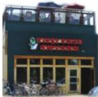
Tipsy Toad Tavern