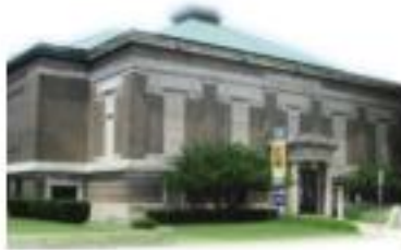
Muskegon Museum of Art