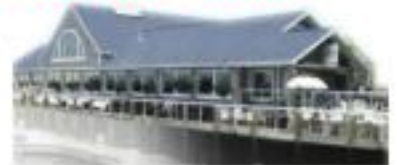
Lake House conference center