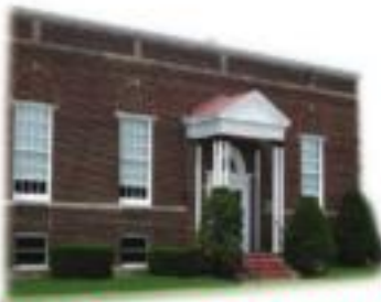
Lakeshore Museum Center