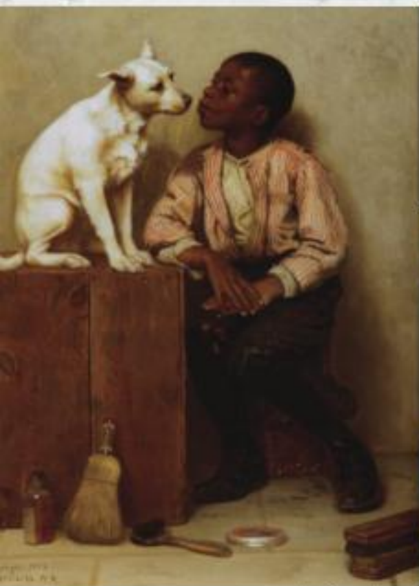
John George Brown Color No Objection, 1903 detail

Art inspires & connects people, community & cultures.