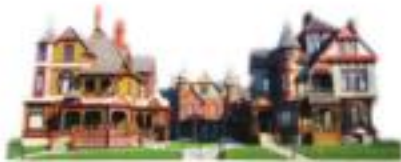
Hackley & Hume Historic Site