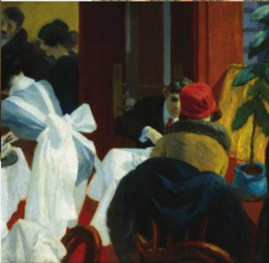
Edward Hopper, New York Restaurant (detail), 1922 Hackley Picture Fund Purchase, 1936.12