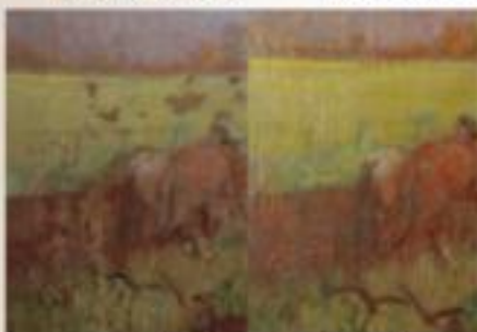
Paint Loss Repair